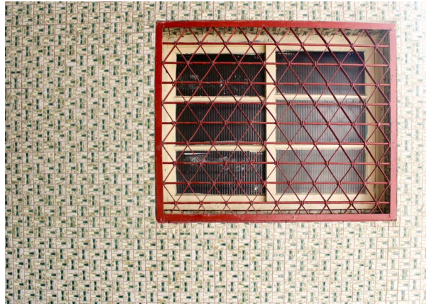
Figure 1, basic design of iron grill with tiles around

However, Zheng (2020) noted that nowadays more and more emerging architects and designers have combined new construction methods such as, acrylic resin, polyurethane, silicone or fuso to substitute to substitute previous construction method, therefore the tile paste one by one on the wall is no longer the mainstream. In addition, in recent years, there are many negative news of exterior wall tiles, such as tiles falling apart according to ( Falling Objects: Another Hazard for Innocent Pedestrians , 2020), or due to poor construction quality control, the adhesive material is deteriorated and polluted, and then bulging (hollow drum), peeling occurs, and frequent water seepage becomes wall cancer. To sum up, there have been many reviews on the use of tiles on exterior walls.